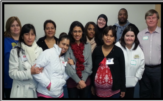
2014 Leaders and Mentors

"This is such a great idea! I am glad I came. They gave us cool things for coming too!" - recently trained mother